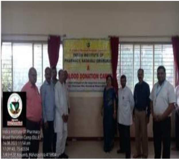
Blood donation camp at Indira Institute of Pharmacy