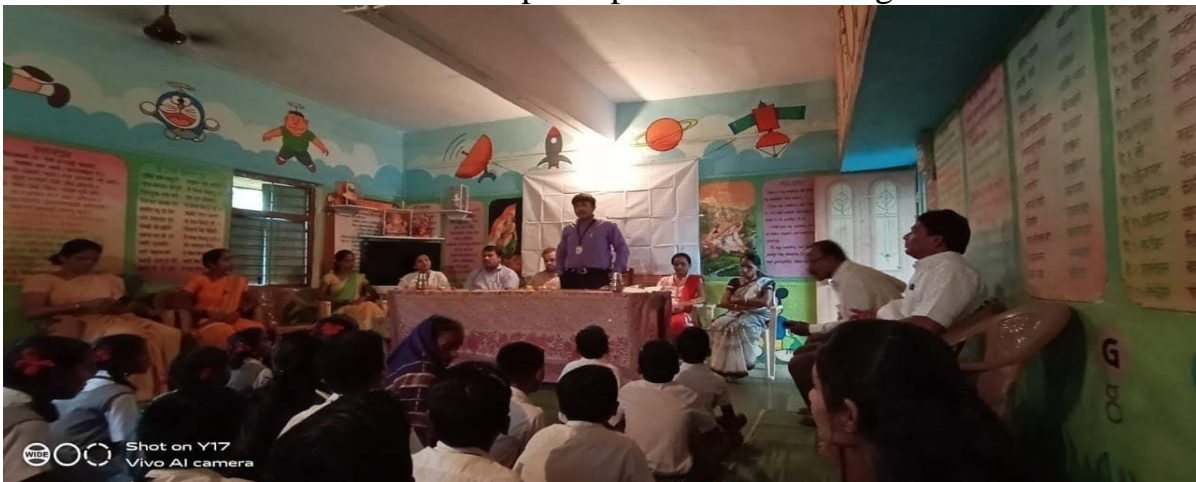
Inauguration of Health check-up camp at Kankadi Z.P. School