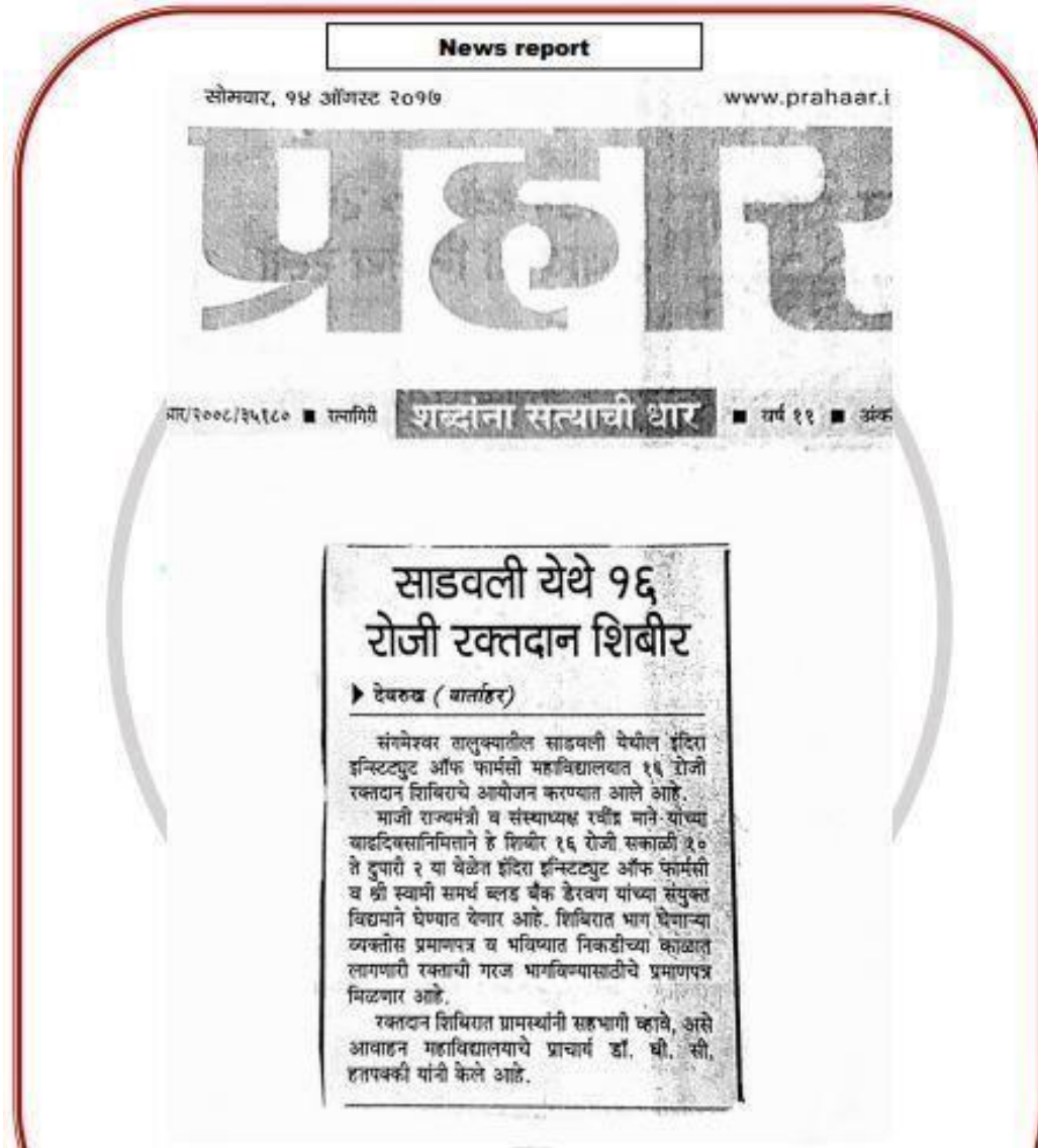
News report of Blood donation camp published in local newspaper