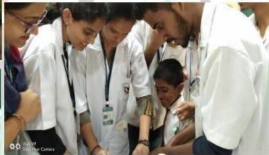
Blood group detection camp at Z. P. School, Patgaon