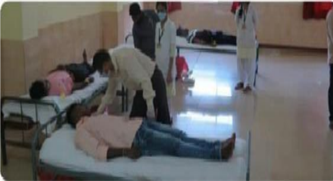
Blood donation camp organized at Indira Institute of Pharmacy, Sadavali