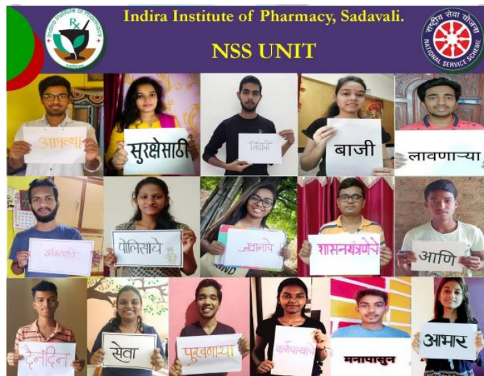
Action photographs showing awareness posters made by the volunteers