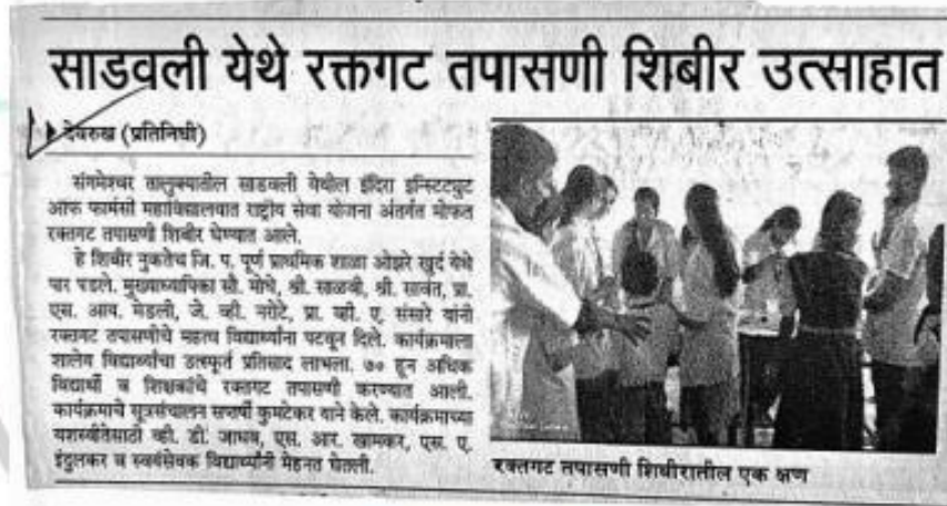
News report of Blood group detection camp at Z. P. School, Ozare published in local newspaper