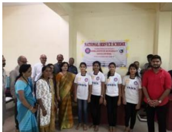
Students participated in Blood donation camp and free HIV screening camp