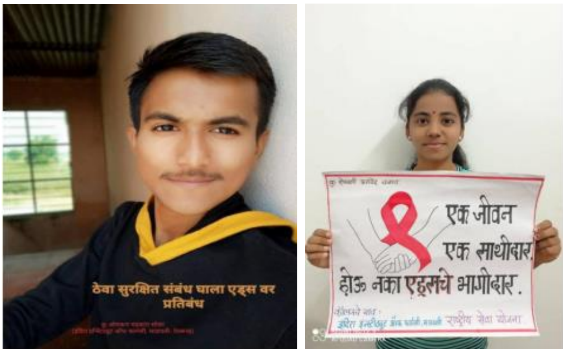
Action photographs showing awareness posters made by the volunteers