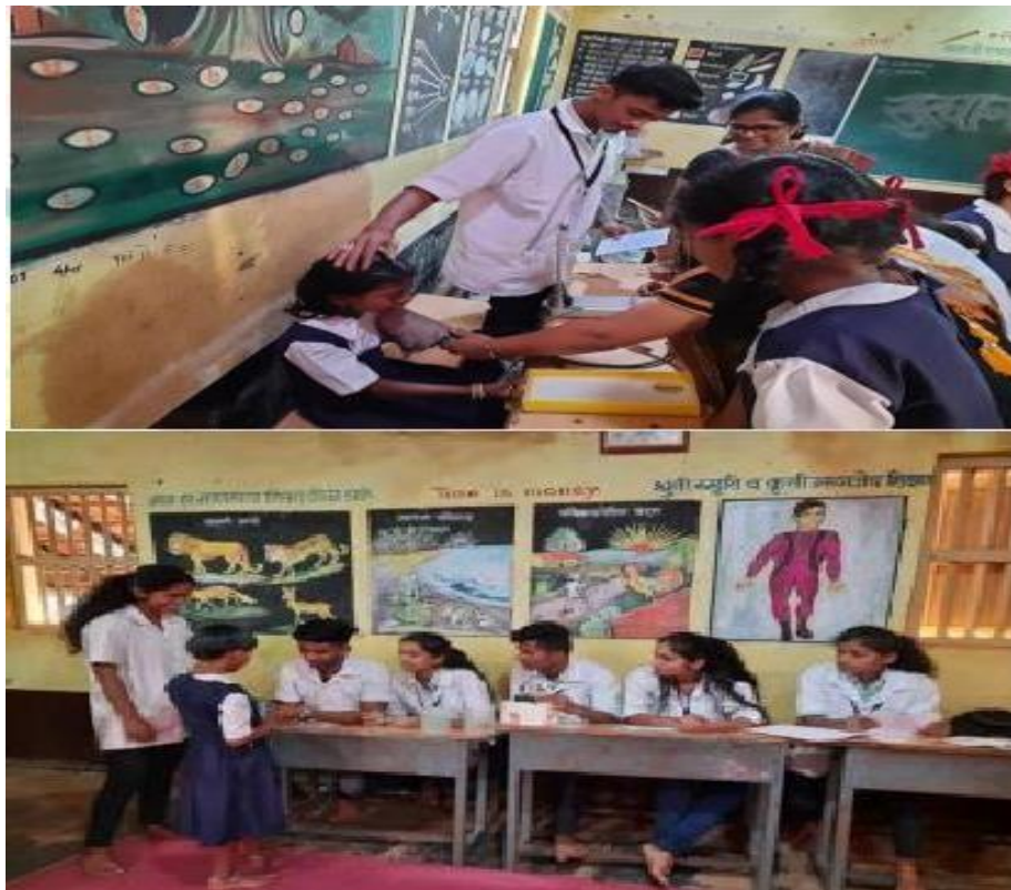
Health check-up camp at Z. P. School, Phansavle