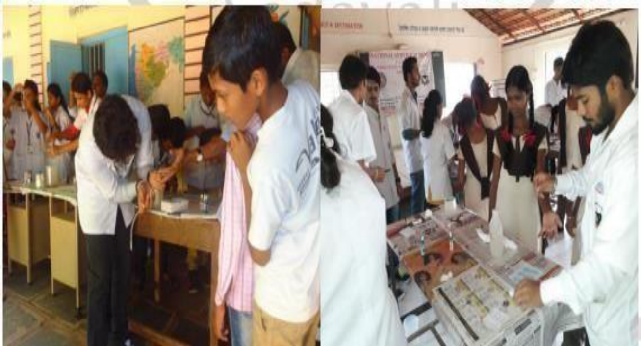
Blood group detection camp at Z. P. School, Sadavali