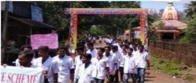
Pharmacist Day Awareness Rally organized at Devrukh