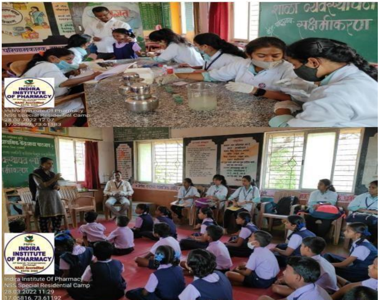
Blood group detection camp at Z. P. School Patgaon