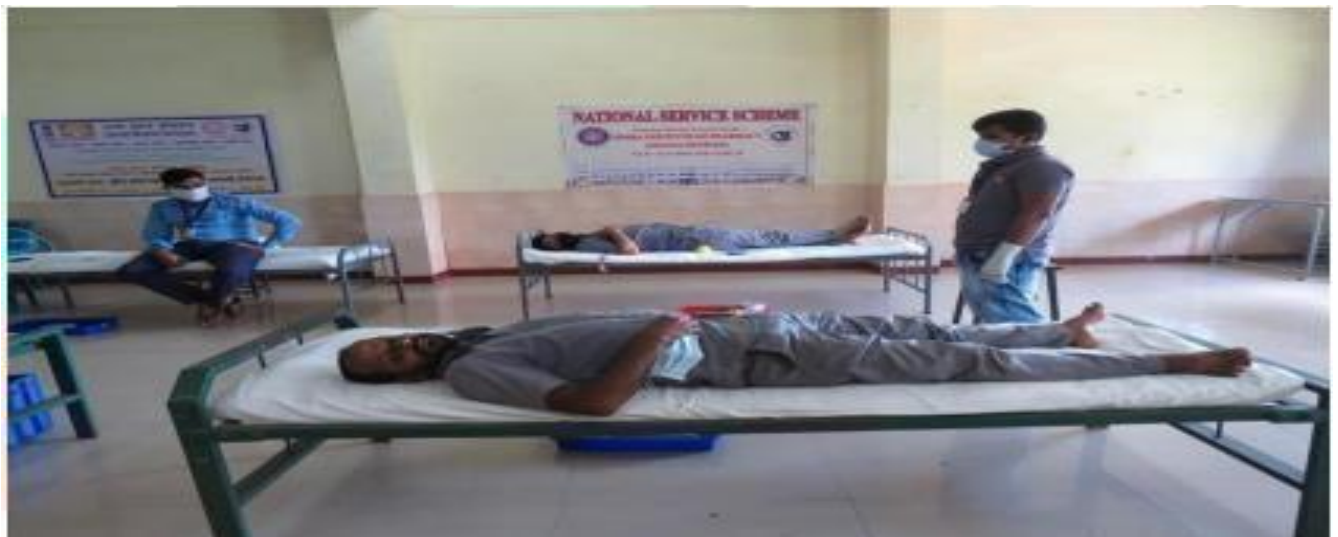
Blood donation camp at Indira Institute of Pharmacy, Sadavali