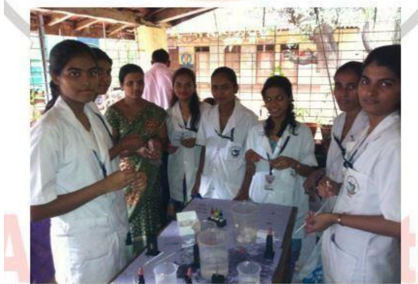
NSS volunteers participated in blood group detection camp at Z. P. School, Washi