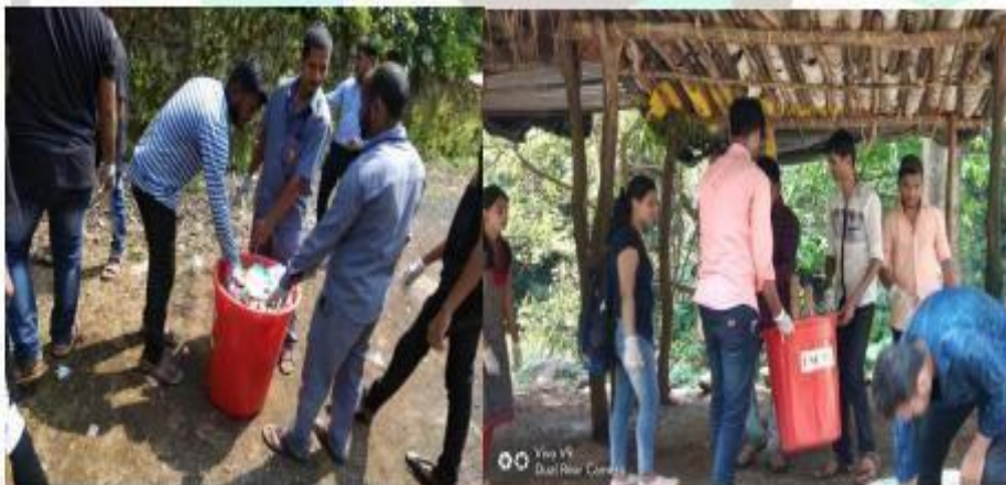
Cleaning drive at Marleshwar Temple