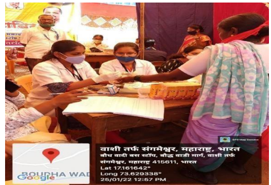
Health Check-up camp at Washi village