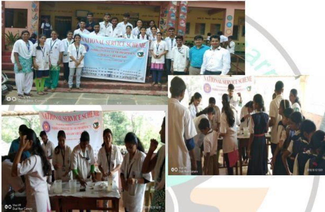
Blood group detection camp at Z. P. School, Ozare