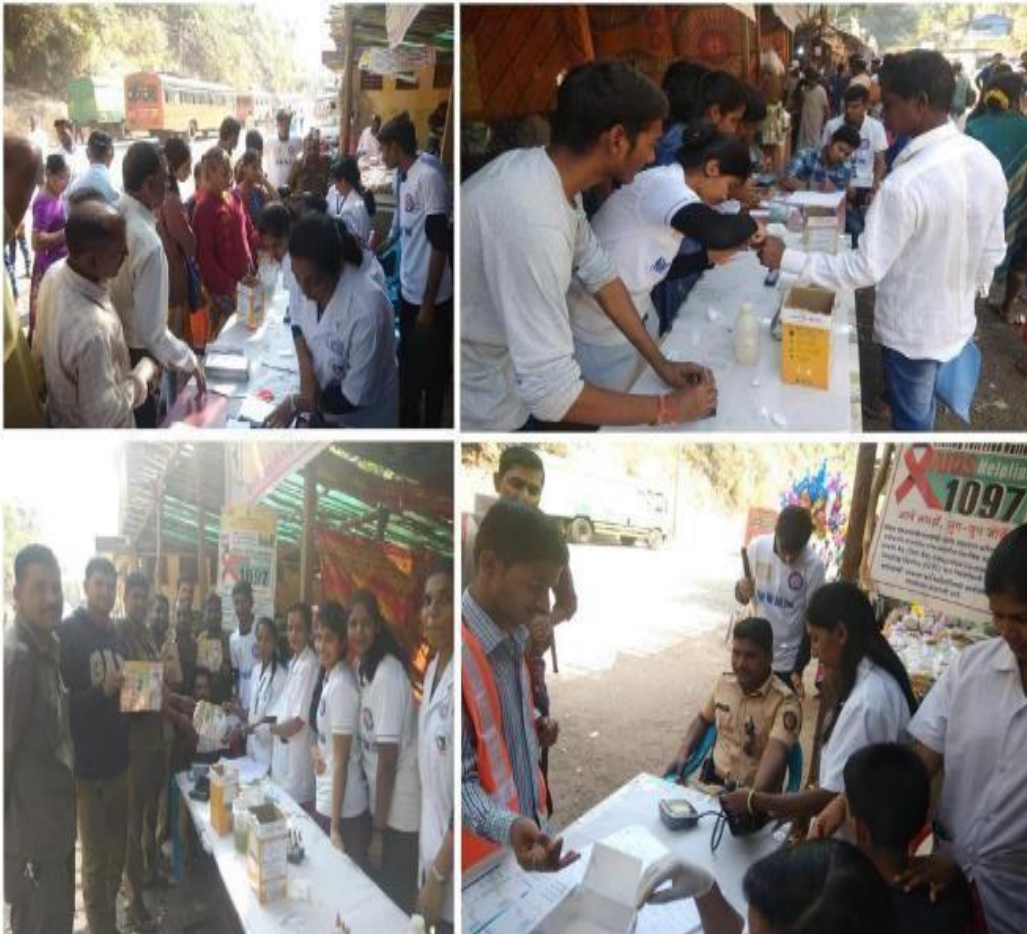
Health check-up camp at Marleshwar Temple