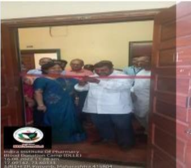
Inauguration of blood donation camp