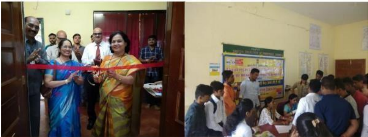
Inauguration of Blood donation camp and free HIV screening camp