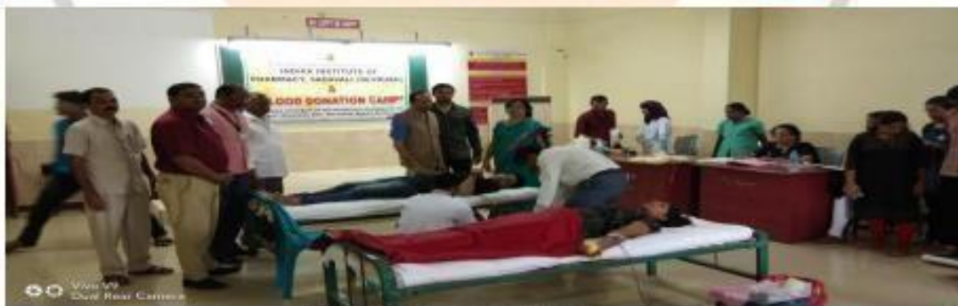
Blood donation camp organized at Indira Institute of Pharmacy, Sadavali