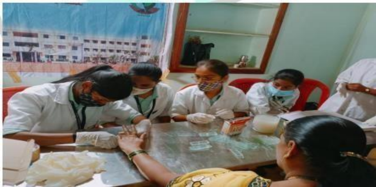
Blood group detection camp at Soljai Temple, Devrukh