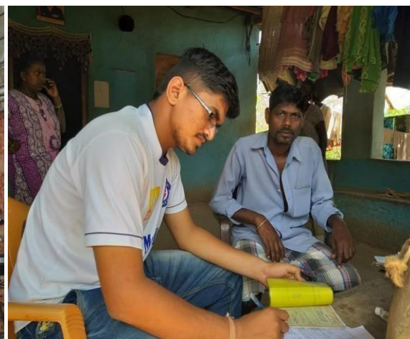
UBA students collecting information from villagers as part of survey