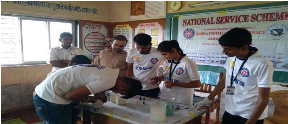
Health check-up camp at Kankadi village