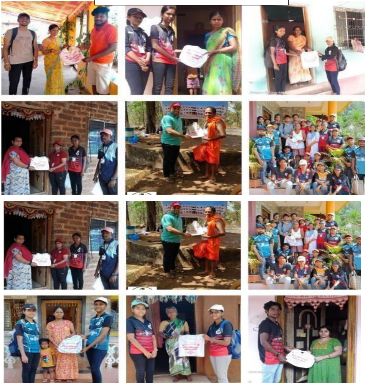
NSS volunteers distributing cloth bags at Patgaon village